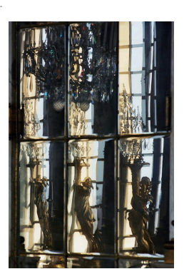
Hall of Mirrors mirrors (beveled mirrors detail), Versailles Palace.