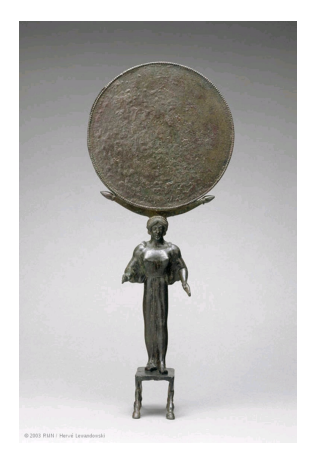
Caryatid\ mirror\ made\ of\ bronze,\ 490-480\ BC,\ Provenance:\ Thebes (?),\ Aegina\ style.\ ©\ photography\ Louvre\ Museum,\ Paris.