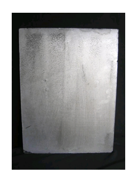
Mercury mirror's back.