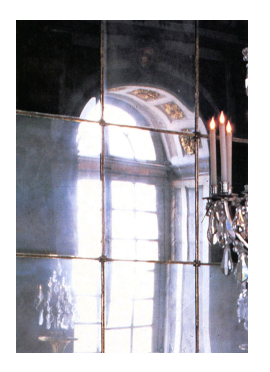
Hall of Mirrors (tinning detail), Versailles Palace.