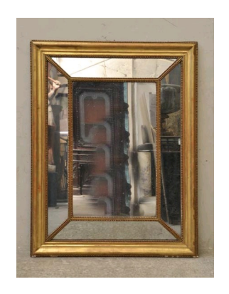
Mercury mirror with a gilded stucco and wood framing.