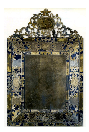
Venetian mirror maker, Mercury mirror with a glass framing, late 17th – early 18th century.